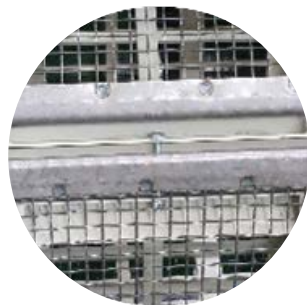
External wire screens optional 2 to 80 mm