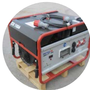
Petrol power generator